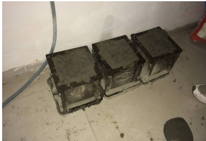
(b) This is the image of the above prepared concrete mixes in the cubical moulds

The same procedure shall be followed for the cube specimens with 5% and 10% crushed glass in the concrete mix.