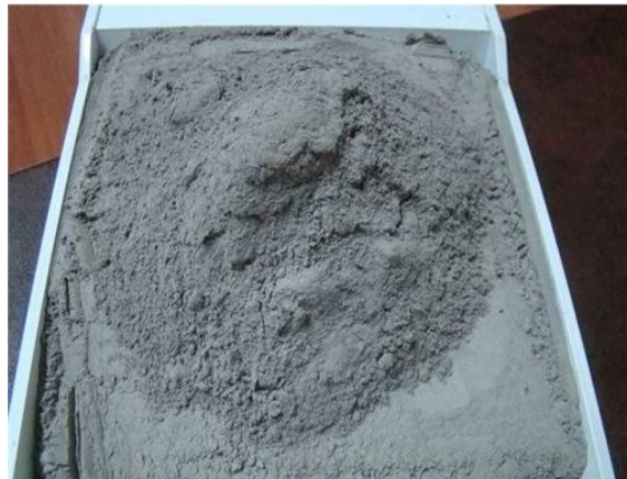
(a) This image shows finely crushed basalt rock which was later added to the concrete cube as concrete mix.